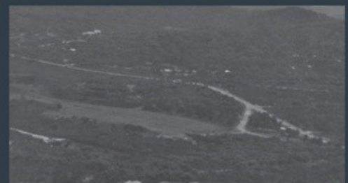
Image credit: Barrenjoey Road, Avalon Beach (1940) showing the original and new routes, Bert Cowell