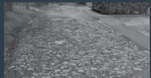
Remains of the Telford road construction method in 2013