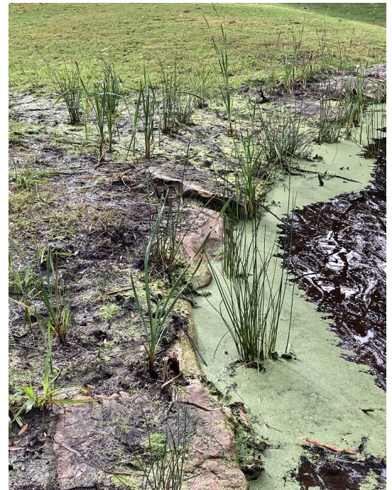
Right: Duckweed — not green slime— floating amongst reeds.