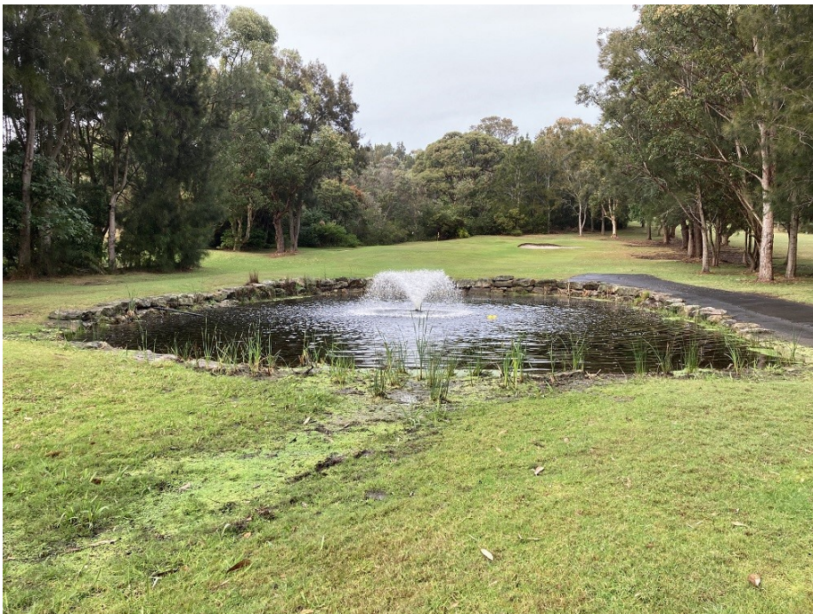
Above: The fountain keeps the water aerated.

The weeds have been removed and aquatic and wetland native plants planted by NBC staff. Warmer weather will get them growing. However the most obvious now is the tiny floating Duckweed, Lemna disperma . It's one of the very tiniest flowering plants and is spread by water birds as they move between ponds.