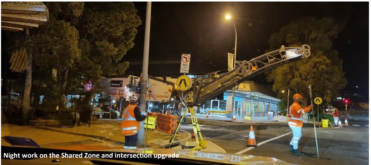
Night work on the Shared Zone and intersection upgrade