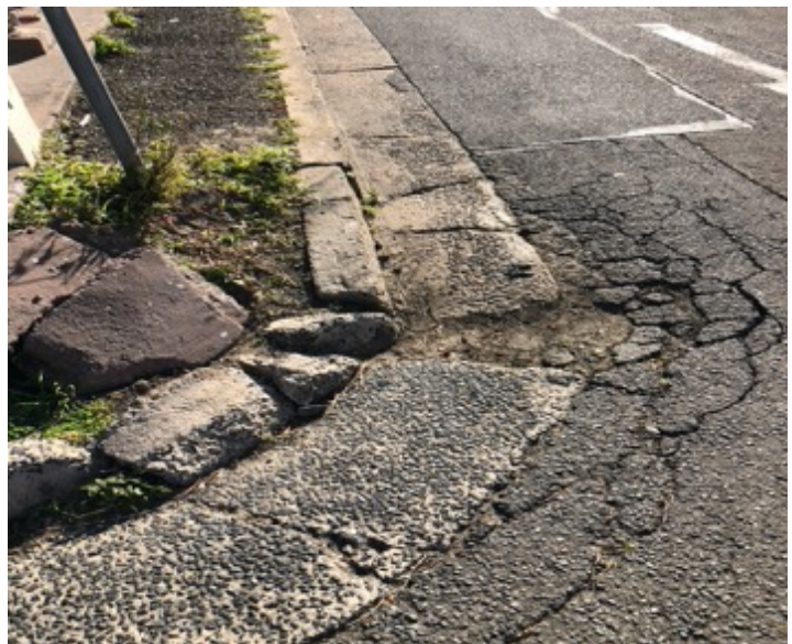
Current poor state of roadway, kerb & gutters in Simmonds Lane