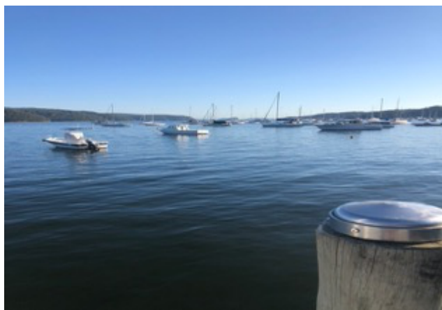
Pittwater looking north to Lion Island