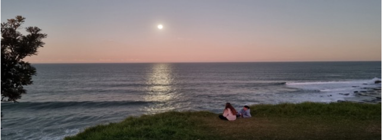
Full moon over Little Av