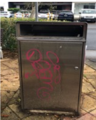
'New' bins in Avalon village and beach reserves.

NBC has recently replaced the Avalon village public bins with stainless steel units. They have become a target for graffiti and often look dirty as rubbish accumulates on the lip & have proved difficult to keep clean. Residents were under the impression that any replacement would be part of the Avalon Place Plan and there would be some input by the community into new designs. The old bins (stainless steel and wood slats) were a design that very much suited our beachside suburb, and were also practical. APA have requested NBC consider a new design for the next round of replacements, that replicates the original wood/stainless steel type (photo at Clareville below) - but uses Mod-wood, Ekodeck or similar (from recycled plastic) which would be in keeping with community expectations to use renewables and environmentally sustainable products – and look good too.