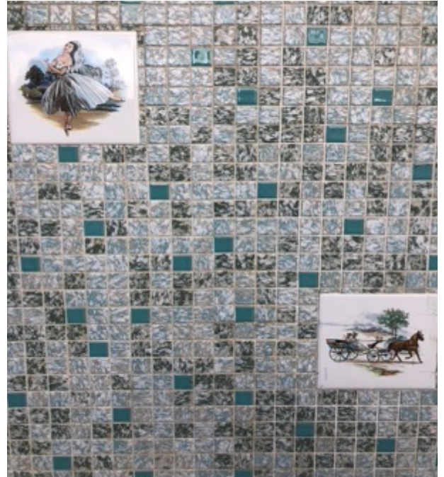
Careel Bay - Living Ocean study about to begin - looking SE from McKay Reserve. Recognise these tiles? Retro, quirky & well loved – former Grey’s Dry Cleaners site. Below photo re Bilgola Bends signs over the years.