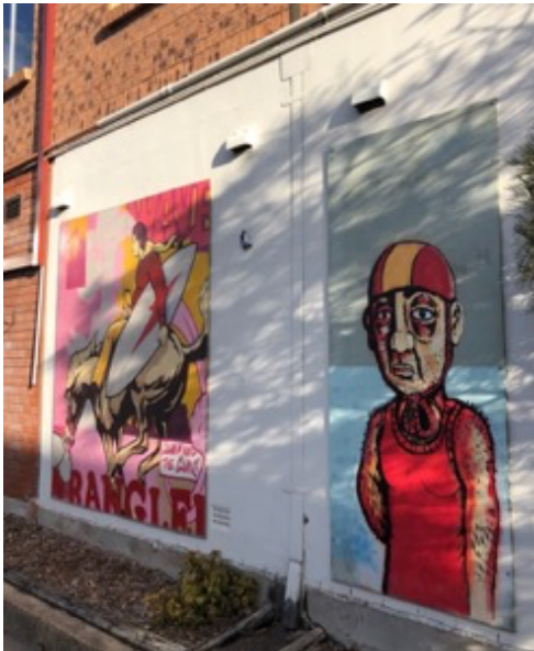
New artworks in Simmonds Lane

NBC advise that Simmonds Lane is on their daily sweeper schedule in Avalon, and if there are any safety issues relating to kerbing, guttering or road surface, they should be reported to NBC.