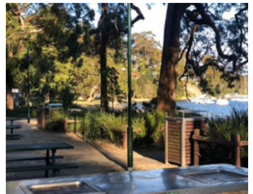
Old bins still at Clareville Beach Reserve