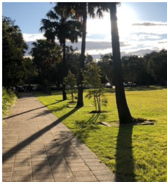
Possums et al need tree hollows, but an old termite nest will do! Melaleucas planted in Dunbar Park. Part of Av Centenary celebrations