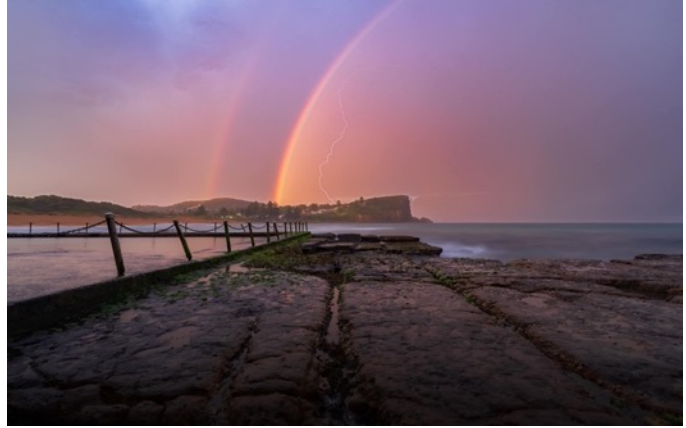
Avalon storm. Amazing photo by Tim Seaton Photography

'HAVE YOUR SAY', submissions close 6/3/22