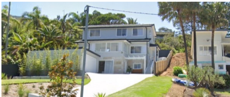
32 Watkins Rd – Proposed path closure. Have Your Say!

https://yoursay.northernbeaches.nsw.gov.au/proposed-road-reserve-closure-adj-32-watkins-road-avalon-beach