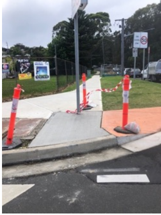
RMS sign concreted into middle of path