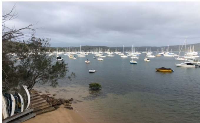
Pittwater looking South