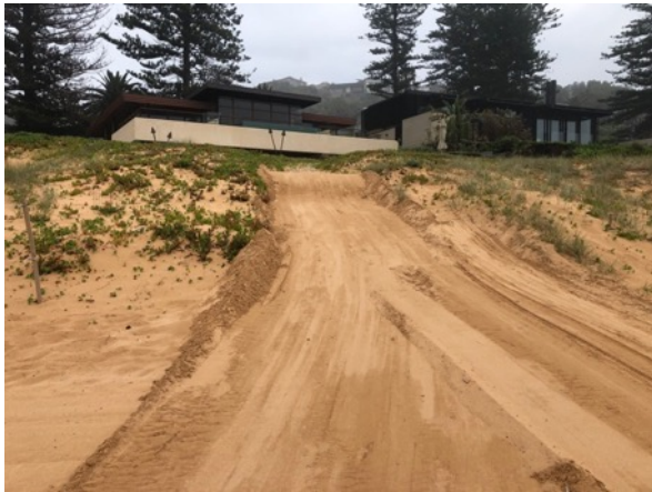
Bilgola dunes damage by tractor

Recently a tractor created a ramp damaging part of the Bilgola dunes. Council advise that this area will be revegetated.