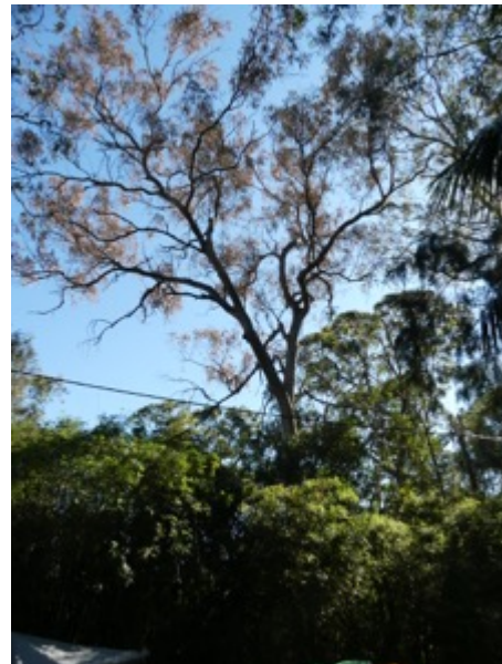
Avalon Beach pool Aug 21 & poisoned spotted gum, Palmgrove Road Sept 21