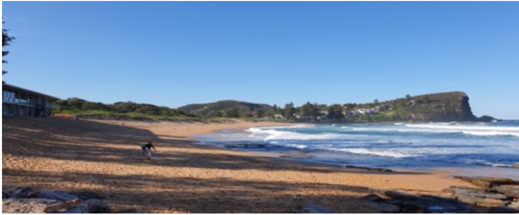
Sunset from Paradise Beach & Avalon Beach looking north