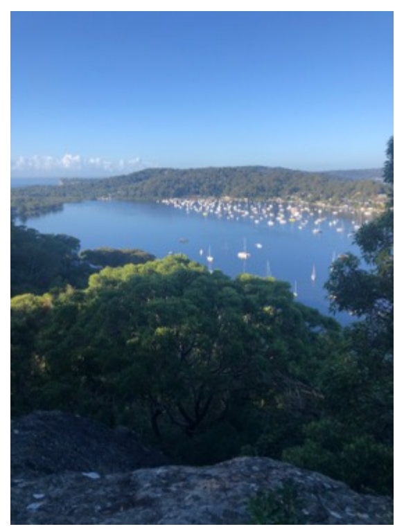
Careel Bay looking SE