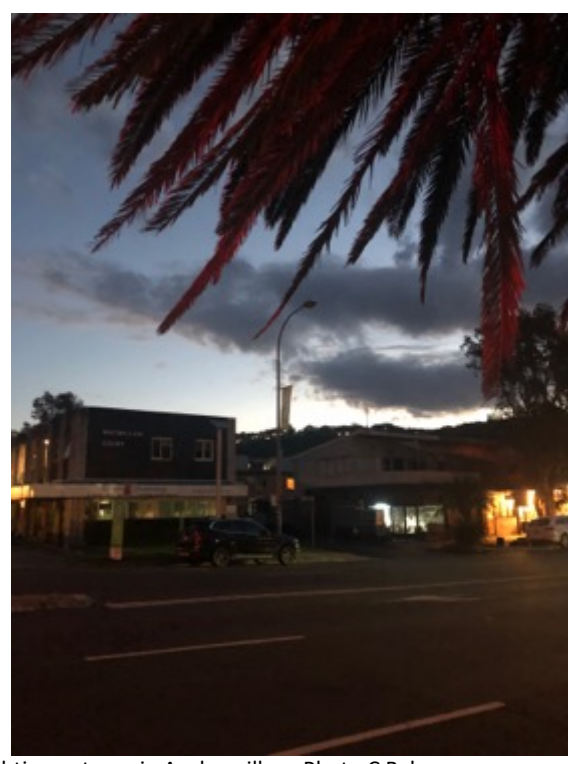
Lighting outages in Avalon village

You can monitor and report issues with streetlights here - <a href="https://www.ausgrid.com.au/In-your-community/Our-services/Streetlights#!/map">https://www.ausgrid.com.au/In-your-community/Our-services/Streetlights#!/map</a>