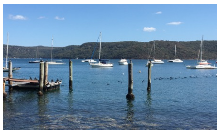
Near Clareville - group of cormorants

ANGOPHORA RESERVE meets at one of the 4 entrances to the park each 3<sup>rd</sup> Sunday of the month. Geoff emails a reminder each time notifying fellow bush carers of the venue to be worked. New members always welcome.