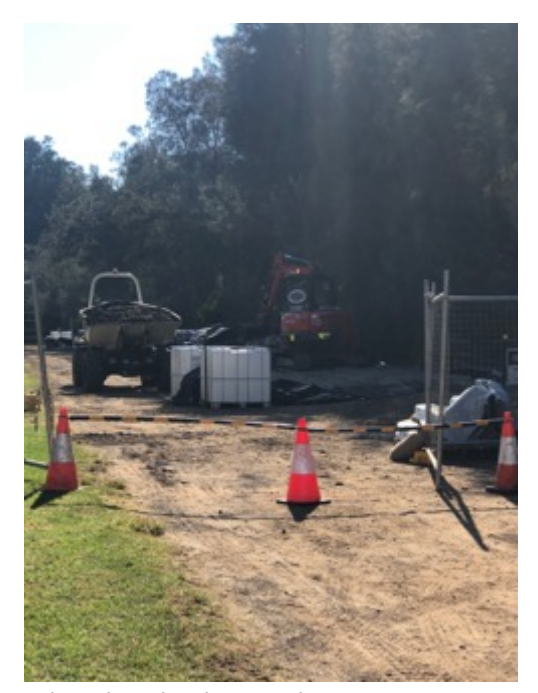
Careel Creek works