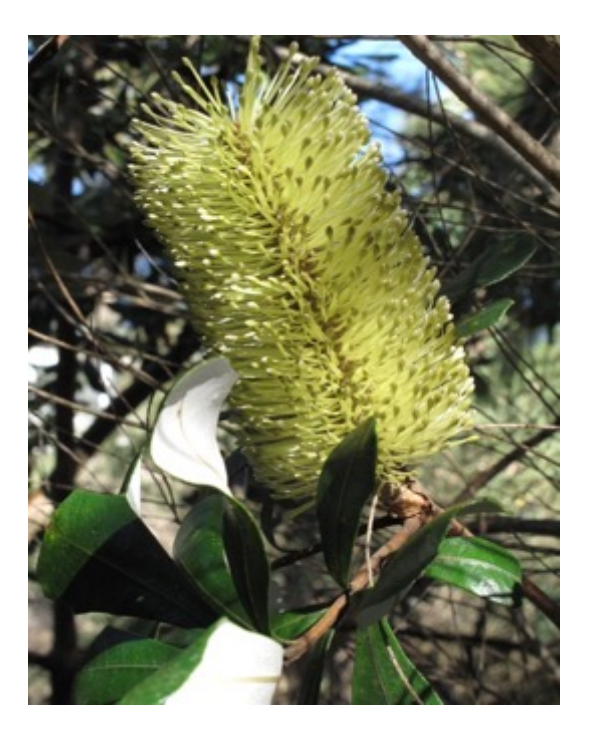
New Catalpa Reserve path Coast Banksia. What looks like one flower is actually hundreds on a spike. Only a few will be pollinated. Every year about Christmas, the seed pods split open and two seeds drop out of each. Most other Banksias shed their seeds only after a bushfire or the death of the branch