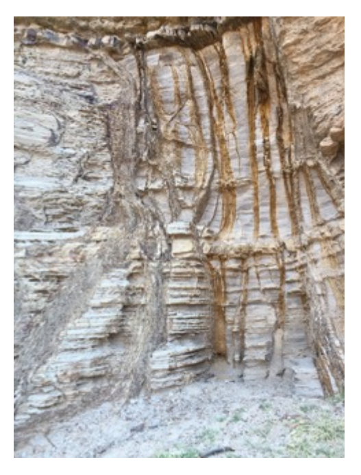
The extraordinary rocks near Avalon pool. It's Narrabeen shale rocks with minerals seeping down through the sedimentary rock layers. A work of art?