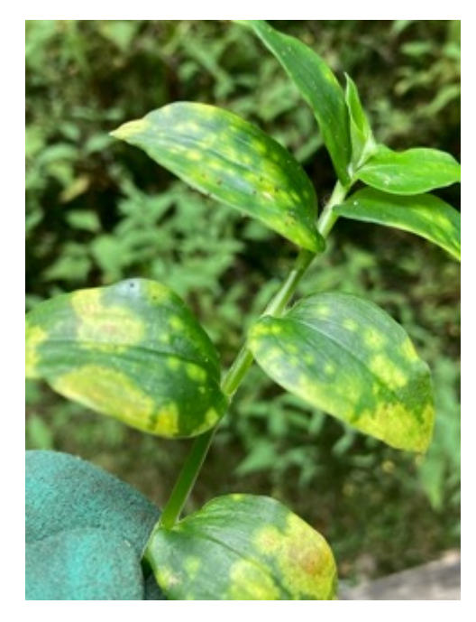
Trad weed, new smut fungus causing yellowing leaves

For more information contact: miranda@wildwords.com.au