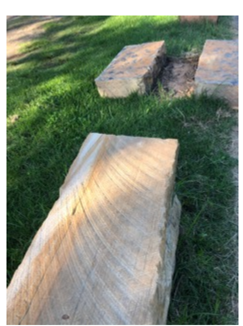
Recent vandalism in Avalon - skatepark fire and sandstone block destruction