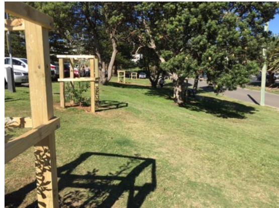
Young Norfolk Island Pine in Des Creagh Reserve and banksias with fencing Av Beach Reserve.