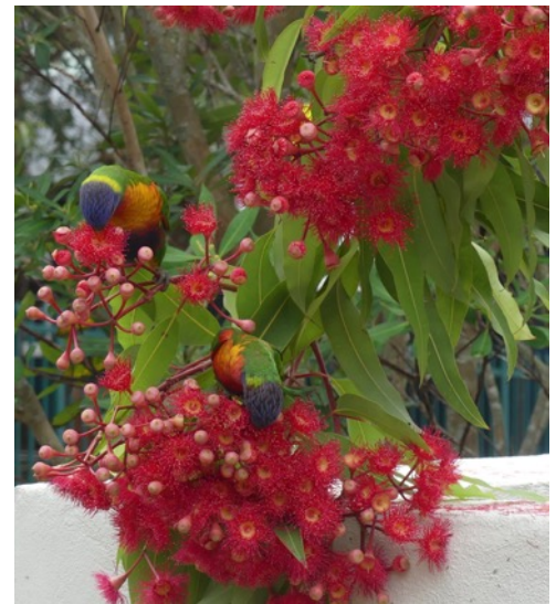
Lorikeets feeding on red blossoming gum.