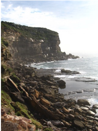
Bangalley Headland