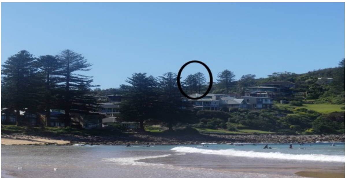
Photo: 3 pines now removed

We are awaiting NBC advice on criteria for nominating particular trees to the newly proposed NBC Significant Tree register and will be advising members accordingly, in order to get our trees listed pronto.