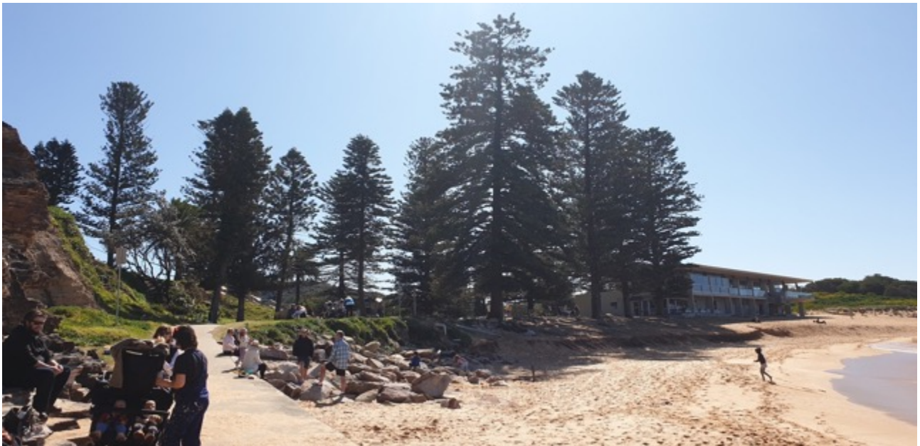
Photos: Original kiosk (previous page) & Avalon Beach by Roger Sayers