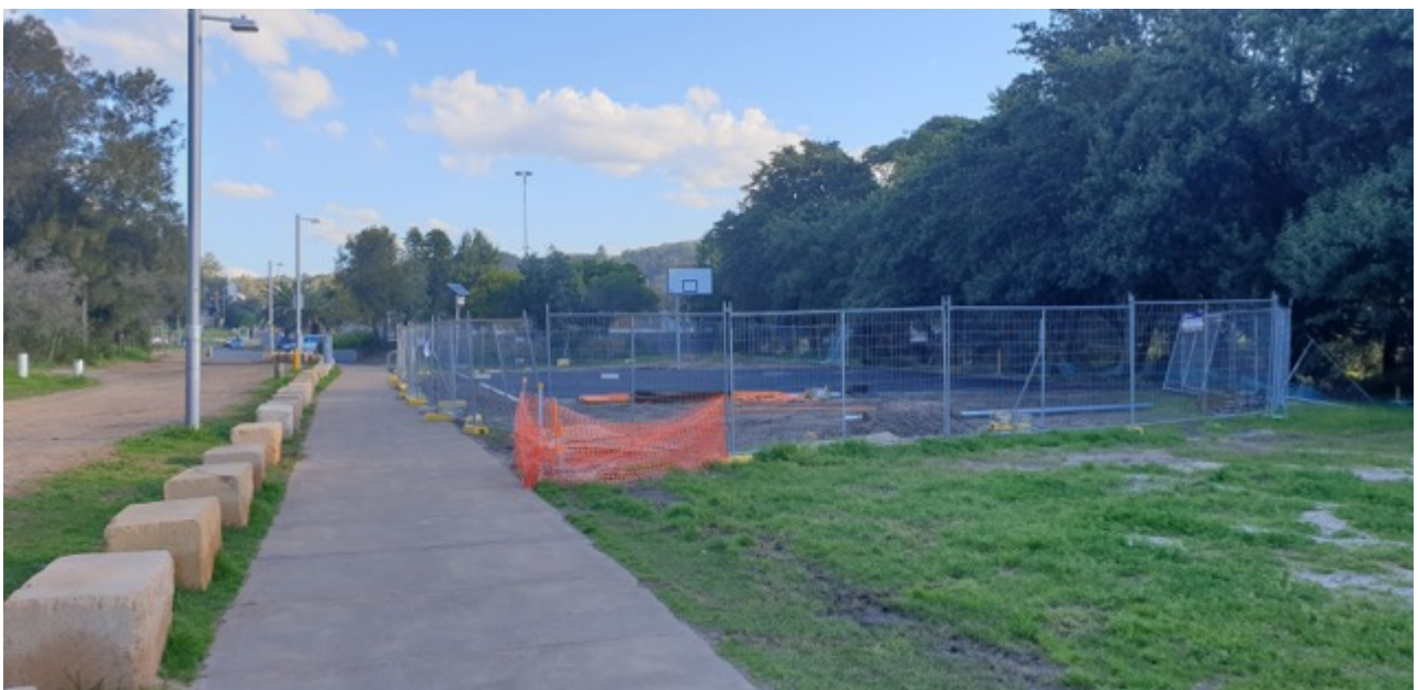
New half basketball court next to skate park