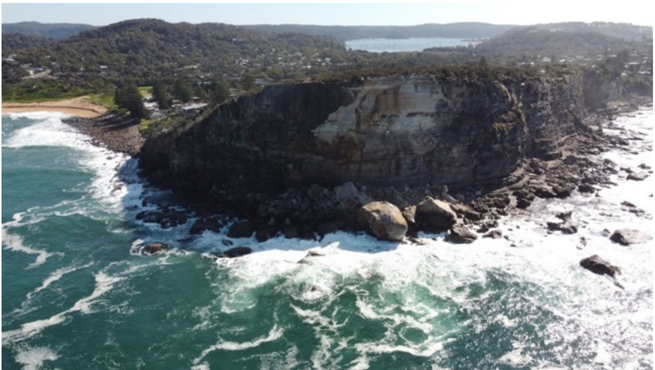
North Avalon Headland after a recent storm. In August 2017 a huge chunk of rock, the Indian Head's “nose” fell off, changing the headland's profile. Then last July the big seas thundering against the fallen rock rolled it into the sea.

https://yoursay.northernbeaches.nsw.gov.au/merger-performance-report