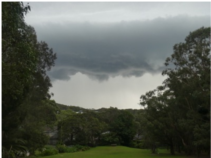
Photos: Toongari Reserve muddy path & Storm over Av Golf Course: C Baker