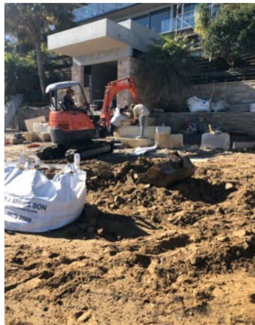
Photos: landslip area & foreshore destruction Hudson Pde