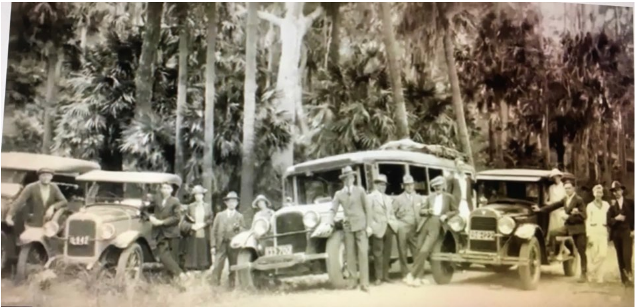
Palmgrove Park, 1927

mountain bikes. It is of great concern currently in Stapleton Reserve & Palmgrove Park. The teenagers are destroying remnant cabbage tree palm groves, spotted gum saplings, burning areas of bush near homes, and stealing tools from homes & the Avalon Community Gardens. The jumps and tracks that are constructed often contain dangerous materials and it is only a matter of time before there is a serious injury, or a fire is lit that will destroy homes (fires have been lit recently, that have threatened homes). Council, Police and the Fire Dept have been informed and we hope all are focussed on finding a place for the teenagers to ride safely in a location that is not environmentally sensitive, but to date, both Council and Police have been quite ineffective & the damage continues at an alarming rate. There needs to be significant time and resources invested by Council into a solution to this problem as it is completely out of hand at present and only seems to be escalating in damage to bushland and numbers of kids involved. Please contact Council and the APA if you are experiencing damage to a reserve in your area.