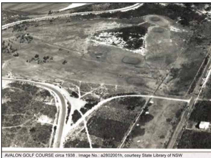
AVALON GOLF COURSE circa 1938.