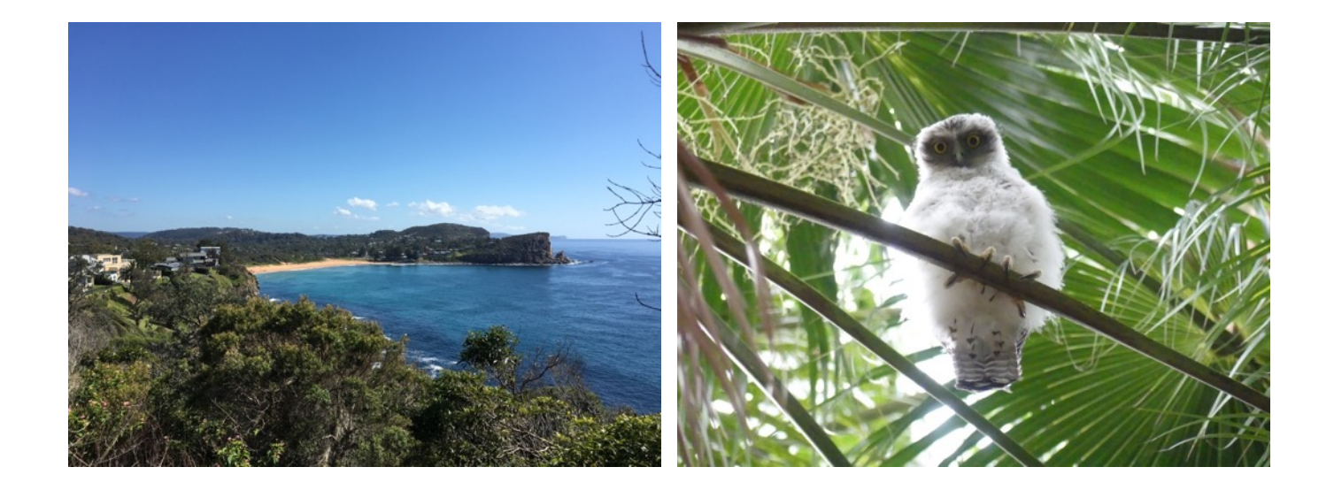
Date March 2019