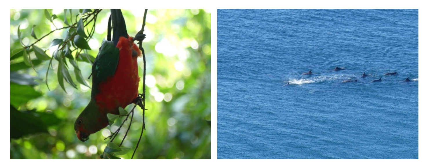
Photo above: King parrot on Avalon Golf Course and pod of dolphins at Avalon